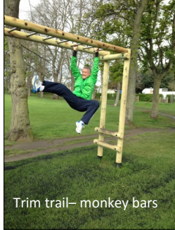
Trim trail- monkey bars