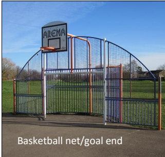
Basketball net/goal end